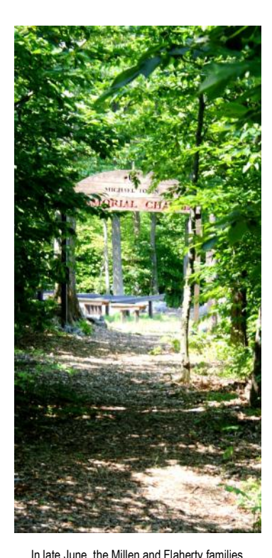
went to Camp Kenan to see how the Chapel and plants held up over the winter. They cleaned up the flower beds, planted a few new things and freshened up the mulch.