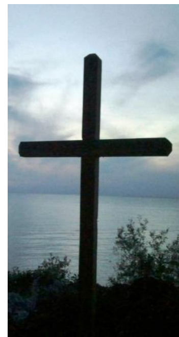
Looking out at Lake Ontario from the Michael Tobin Memorial Chapel at Camp Kenan.